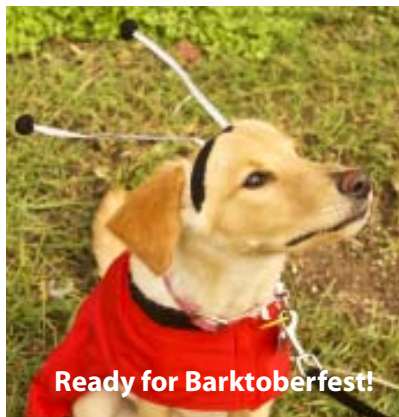
Ready for Barktoberfest!

The gate will open at 8 am, so get there early for the best selection. We'll stay open until everything is gone or noon, whichever comes first! Shelter dogs will be there to say thanks